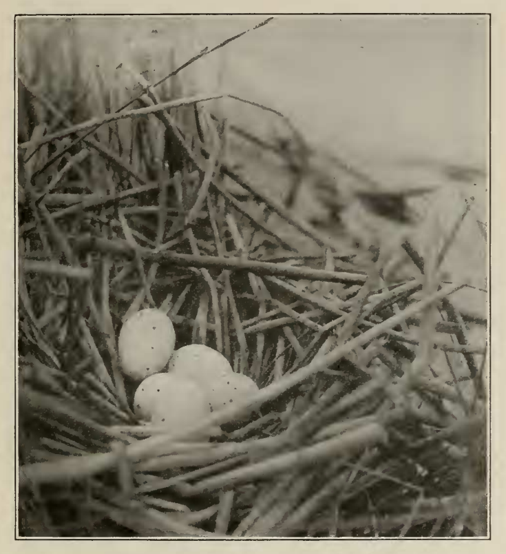
NEST AND EGGS OF FLORIDA GALLINULE

In the second class are included the following twenty-one species which nest only in the artificial groves and about the buildings: Bob-white, Mourning Dove, Screech Owl, Downy Woodpecker, Red-headed Woodpecker, Flicker, Chimney Swift, Phoebe, Blue Jay, Crow, Baltimore Oriole, Bronzed